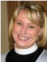
From the Rector

I'm not sure I believe in making New Year's resolutions. Somehow they always thwart the actual resolving and improving I'm trying to do. In the end, I wind up more frustrated than determined. Yet, there are things that need re-solving in our lives -- aspects of our personalities that need a little shift, habits or patterns we've gotten into that hinder rather than help, choices we probably need some assistance in making. Knowing there are things to be solved -- in our hearts and minds, in our lives, in our worlds -- doesn't mean we know how to solve them though. Life's mysteries abound!