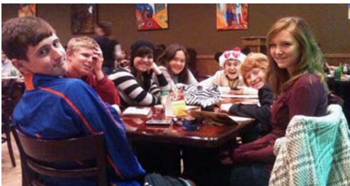
The St. Francis Youth Group ends the evening with a pizza party.